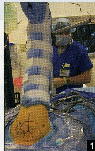
Figure 1: Patient in the lateral decubitus position in an arm traction device with approximately 65° abduction, 15° forward flexion, and 10 lbs of traction.

In a patient with a suspected tear of the posterior labrum, the lateral decubitus is preferred, especially when the pathology is in the posterior or posteroinferior aspect of the joint; an arm traction device provides sufficient traction to easily visualize and work in this area of the joint (Figure 1). Glenohumeral arthroscopy is initiated from a standard posterior portal, which is made slightly lateral than our beach chair posterior portal, such that the lateral edge of the acromion and portal are nearly in-line, and 1 cm inferior to the edge of the acromion. This allows the posterior portal to be angled slightly inferiorly (approximately 15°-20° of inclination) relative to the glenoid rim. An anterosuperior portal is made in the superior aspect of a rotator interval and a clear 5-mm cannula inserted. After