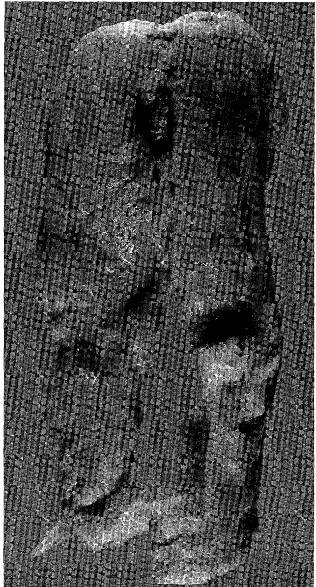
FIG 2. Gross appearance of allograft.

The majority of the literature regarding patellar-tendon allografts has been directed towards disease trans-